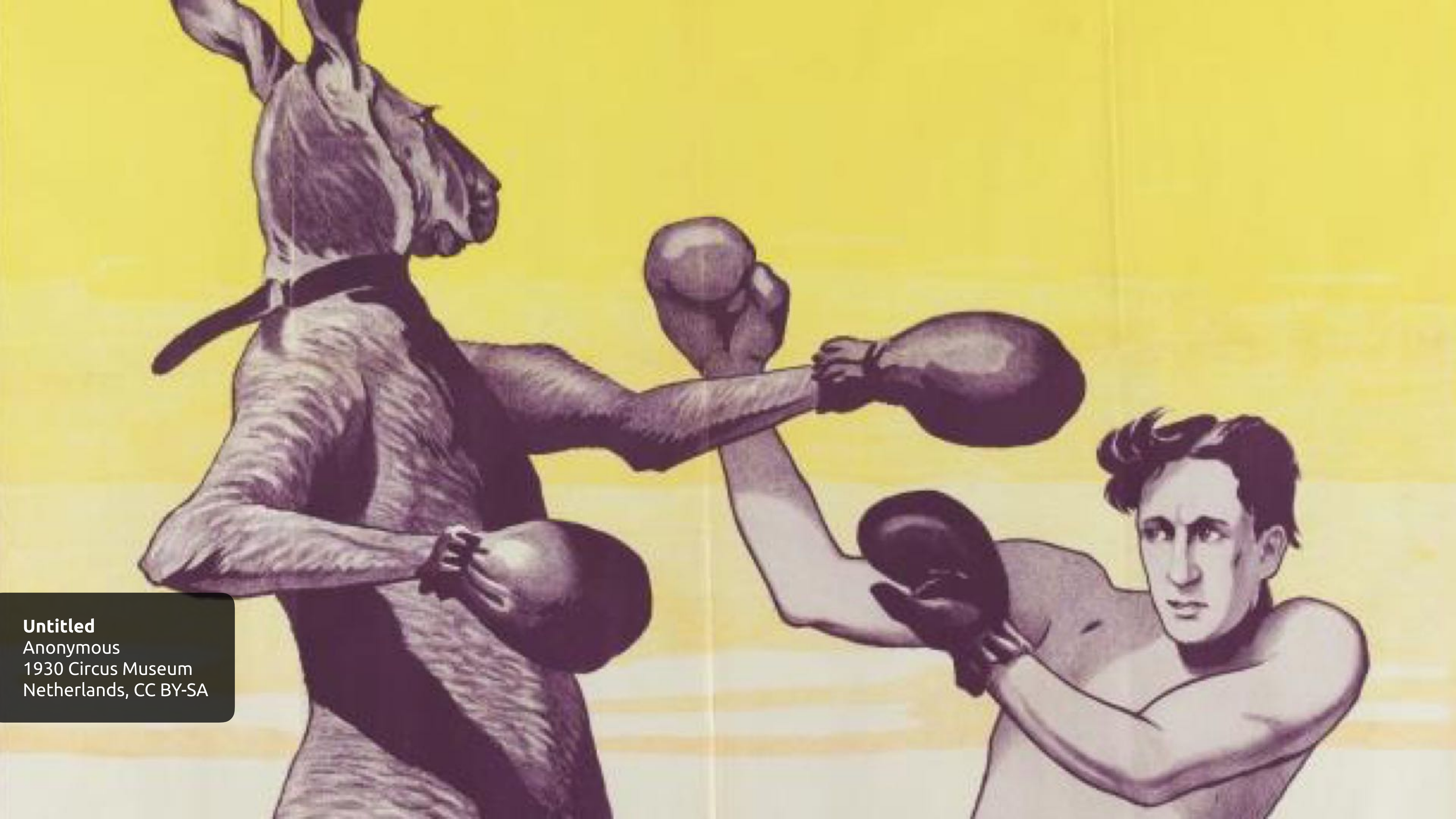
Untitled Anonymous 1930 Circus Museum Netherlands, CC BY-SA